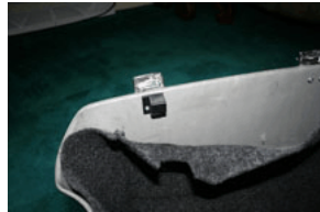
8. Lay out the liner lining up the black latch. This will act as your locator in the box.