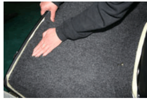
5. Push lid liner into position working your way around the lid. Spray one panel at a time.