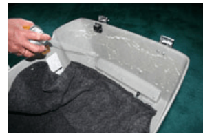
9. Start with this side panel. Spray adhesive liberally and push liner into place. Work out wrinkles with your hand.