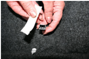
7. After smoothing out the seams in the box liner, locate the lighting cord, run it through the hole and mask it.