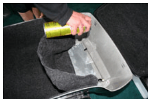
11. Spray & work your way around the box pushing lining into place.