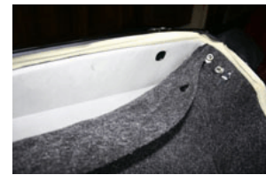
6. Now spray the last side panel after removing the lock. Once completed reinstall lock into place.