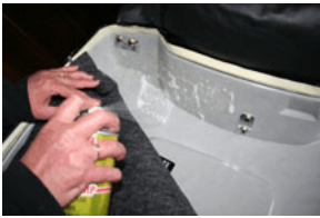
4. Mask around gasket seal to prevent adhesive over spray. Pull back liner and spray adhesive liberally... lots. It lets the lining slide around easily into place.