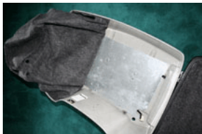
10. Once this panel is in place, fold back lining to expose the box.