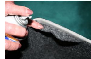
12. Check your edges for loose lining. Add adhesive where required.

Routine cleaning may be done with a damp cloth. Stains may be removed with a rug cleaner. #8794 2001-2007 Tour Pack FLHT, FLHTC Charcoal #8795 2001-02007 Tour Pack FLHT, FLHTC Silver #8796 Lid only all tour models all years Charcoal #8797 Lid only all tour models all years Silver. 100% made USA Sumax, 122 Clear Road, Oriskany, N.Y. 13424 U.S.A. Ph# 315-768-1058 www.sumax.com