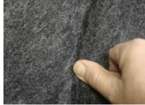
2. Flip over the liner and smooth out the seams.