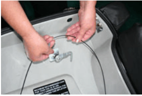
1. Remove wire stay and lock in the lid. Clean inside surfaces.